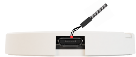
Figure 1 - USB Tc temperature is measured on the metal sleeve of the micro-USB programming port. To measure USB Tc, insert a K-type thermal probe between micro-USB and top encasement of the ORB controller as shown. Solder the tip of the thermal probe to the center of the USB connector.

Note: Temperature conditions applicable for 4000K, 100% intensity